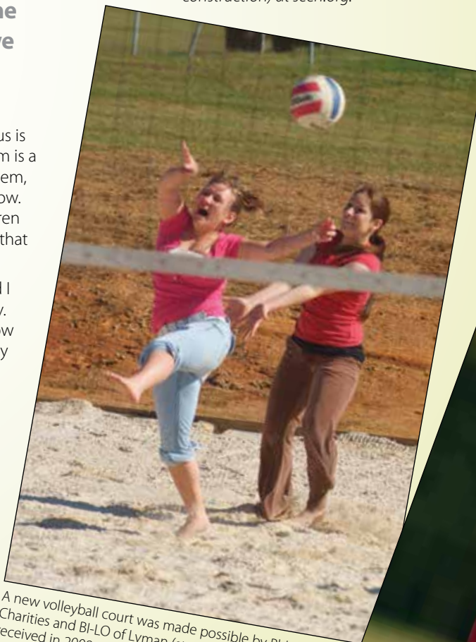
A new volleyball court was made possible by BI-LO Charities and BI-LO of Lyman (store 446) through a grant received in 2008. Special thanks for making a positive impact on our children and visitors to our campus.