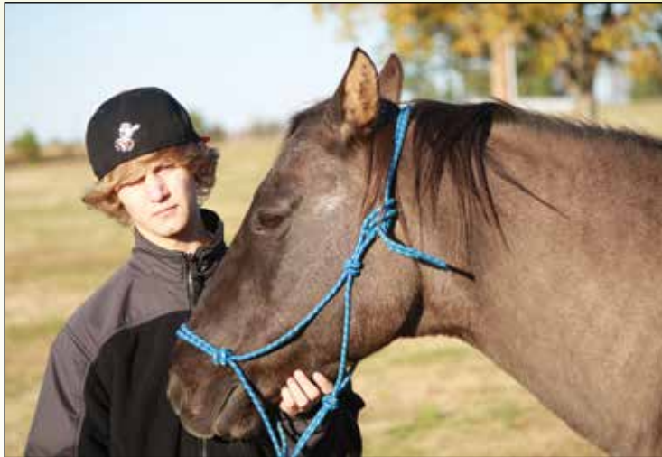
Buddy was abused when he was young, but he's found good friends, better prospects and much greener pastures at Southeastern Children's Home. A former resident said, "I always loved working with the horses. I loved it so much that after graduation, I decided to work in an animal shelter."

There's no horsing around on Tuesdays, because Buddy has work to do. Buddy is busy building friendships with our kids.