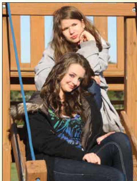
State cutbacks mean fewer children will be removed from potentially harmful situations.