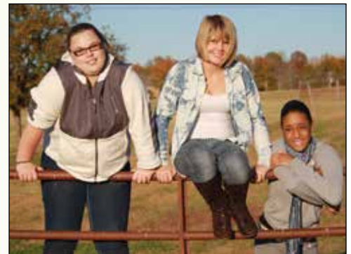
Your gifts make smiles possible year-round.

If you have questions or concerns, please do not hesitate to call me at 864.439.0259.