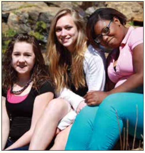
It's up to us to keep alive the memory of those who've made a difference in our lives.

Sometimes, the best way to say "thank you" is to continue exhibiting generosity towards others.