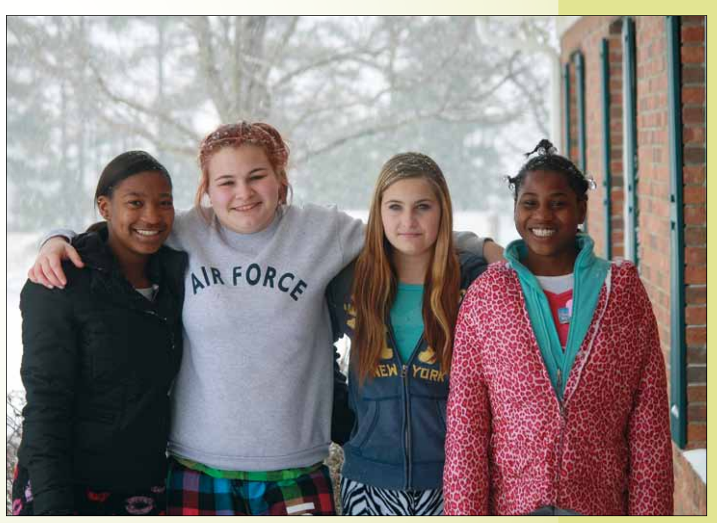
Southeastern residents enjoy the late winter snow that fell in Duncan February 12-13, 2014