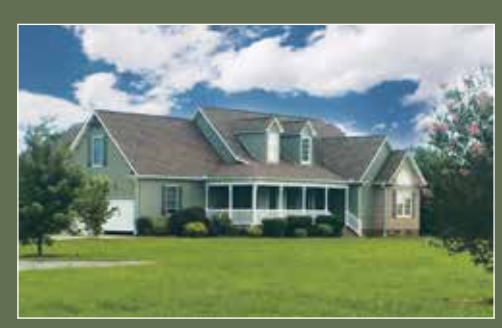
This home purchased by Southeastern in 2018 is being upfitted for residency.

We're ever mindful that Southeastern's ministry would not exist for thousands of broken children were it not for the multitude of people, particularly our donors and prayer warriors, who come forward to bless this ministry every day. Which is exactly why we gathered that wet and wonderful winter evening – to celebrate and give thanks for the fifty years that God has blessed our home.