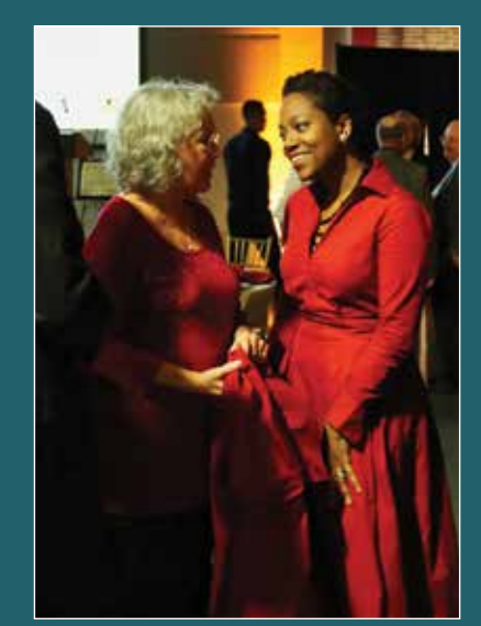
Fellowship and remembrance during the 50th anniversary gala.

Each of us felt a part of something special