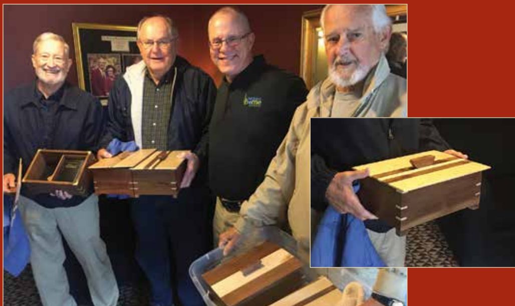
Thank you to Zoar UMC for the beautiful handmade prayer boxes. Each box contained New Testaments and room for personal belongings; every child received a prayer box.

Shop with Amazon Smile and give back at the same time by choosing Southeastern Children's Home as your charity of choice.