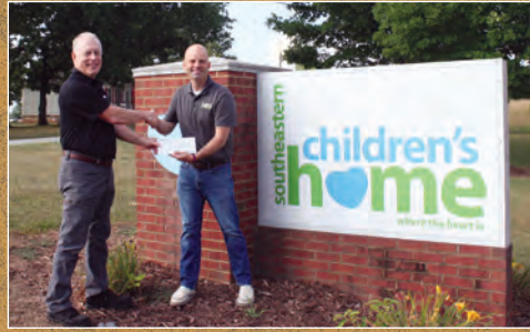
The Timken Foundation funded upgrades to our HVAC system.

Thank you for being our partners in ministry to children in need.