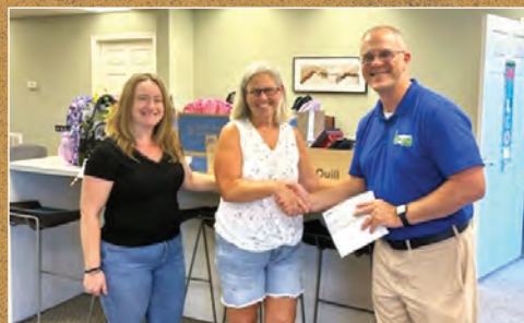
The Swift Corporation's gift helped us purchase much-needed supplies.

This year, we had five different days on campus when workers from churches and youth groups came together to help us maintain and improve our campus. What a blessing.